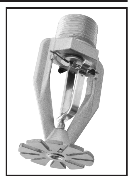
Pipe Thread Connections 3/4 inch NPT

Maximum Working Pressure 175 psi (12,1 bar)